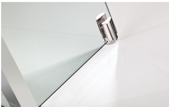
Optional adjustable foot (supplied with H3SPL2CS)