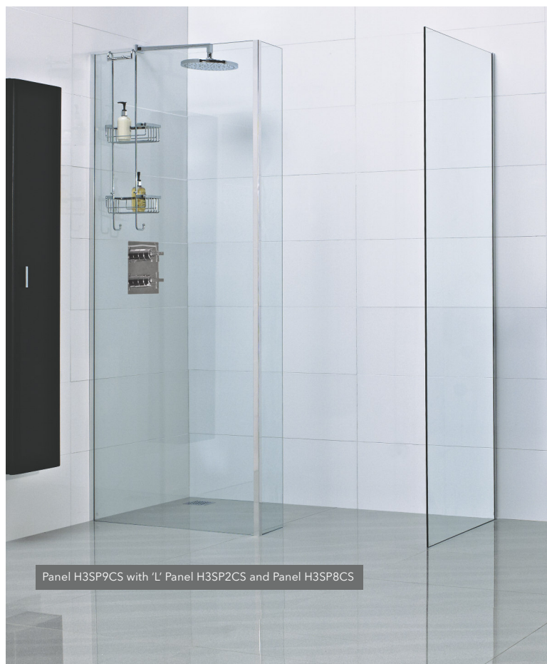
Panel H3SP9CS with 'L' Panel H3SP2CS and Panel H3SP8CS