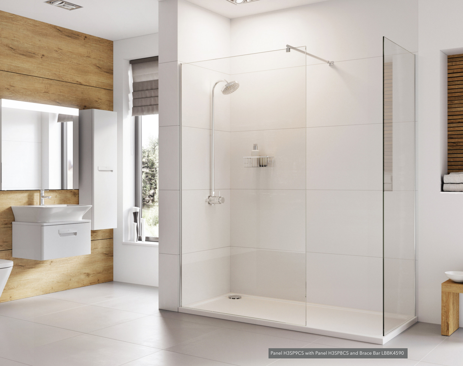
Panel H3SP9CS with Panel H3SP8CS and Brace Bar LBBK4590