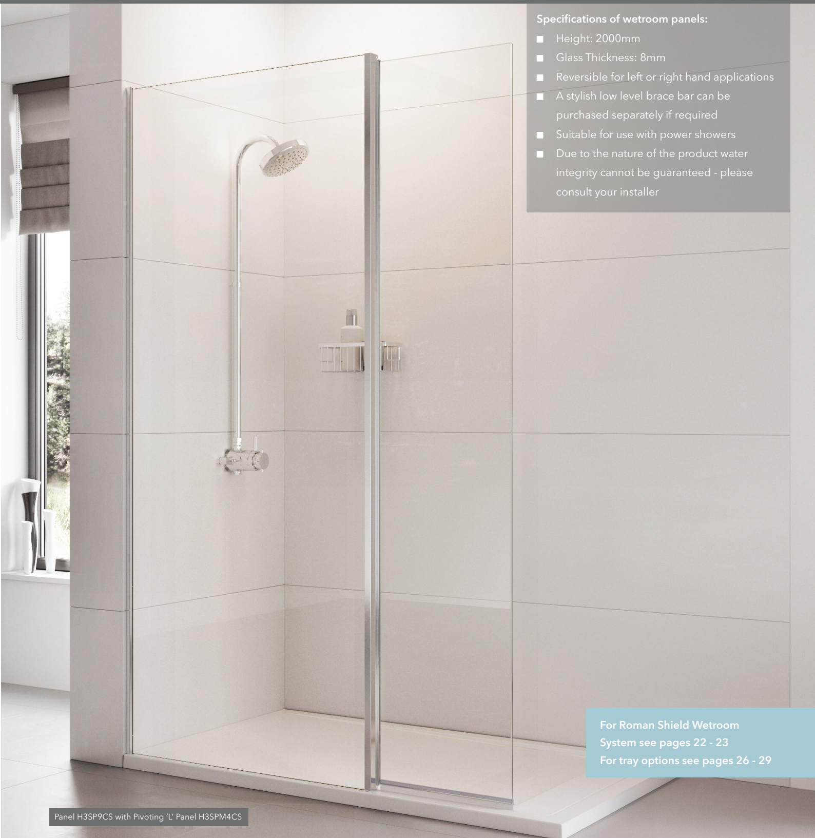
Panel H3SP9CS with Pivoting 'L' Panel H3SPM4CS

For Roman Shield Wetroom System see pages 22 - 23 For tray options see pages 26 - 29