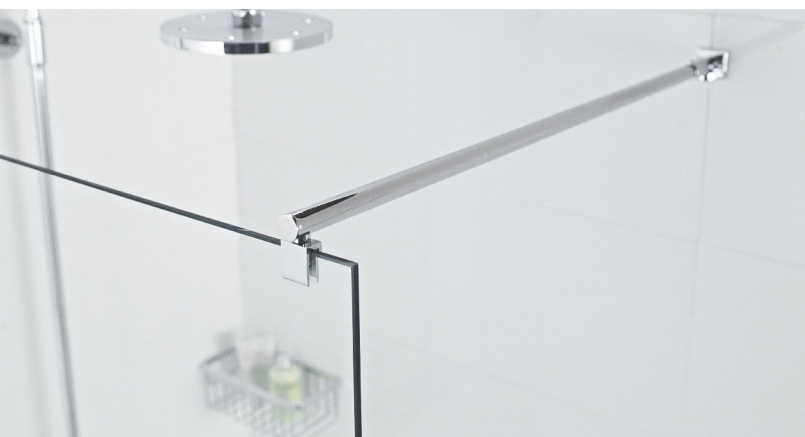
LBBK4590 brace bar back to wall or can be cut to fit at 45° angle