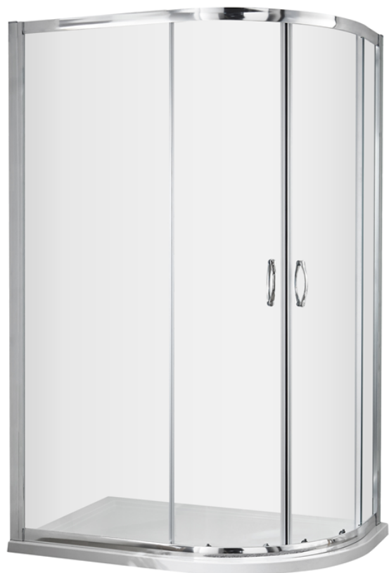
Ella Offset Quadrant Enclosure

Description: Ella 1200X900 Off/Set Enclosure 1850